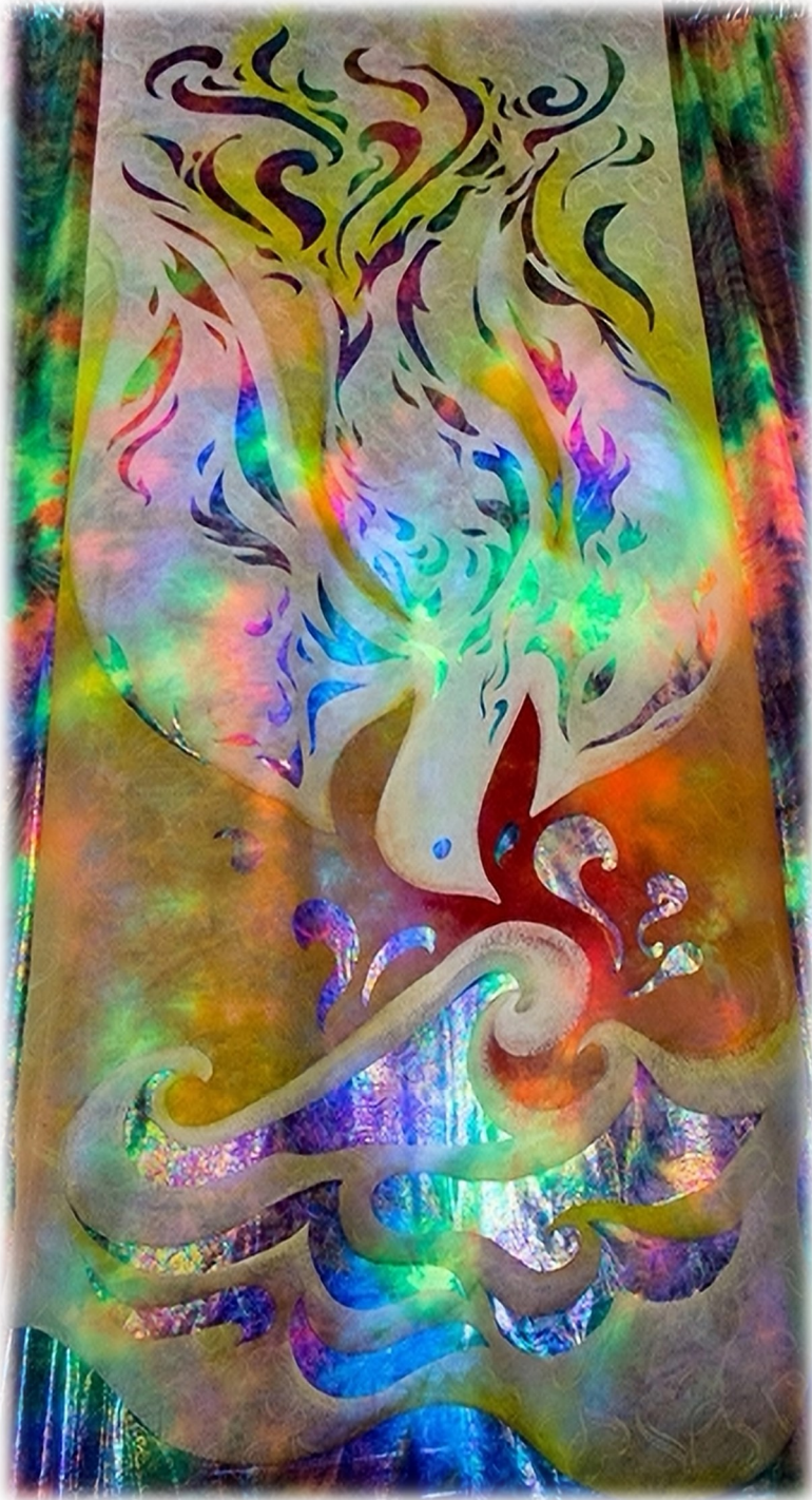
Artist: Gwen M. Stamm, (USA)